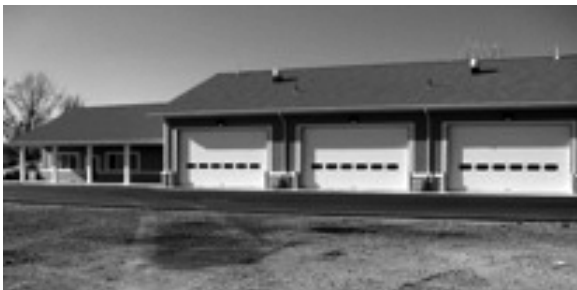
Pictured above: the new Public Works garage and office space. Pictured below: the new salt shed and de-icing station.

The plan, negotiated by Township officials, provides for: removal of the existing storage building, garage space and salt shed; relocation of the de-icing station; a bulk storage bin and parking; construction of a new 4,400 square foot garage space, 1,800 square feet of offices and a new salt shed. No municipal funds were used for this project.